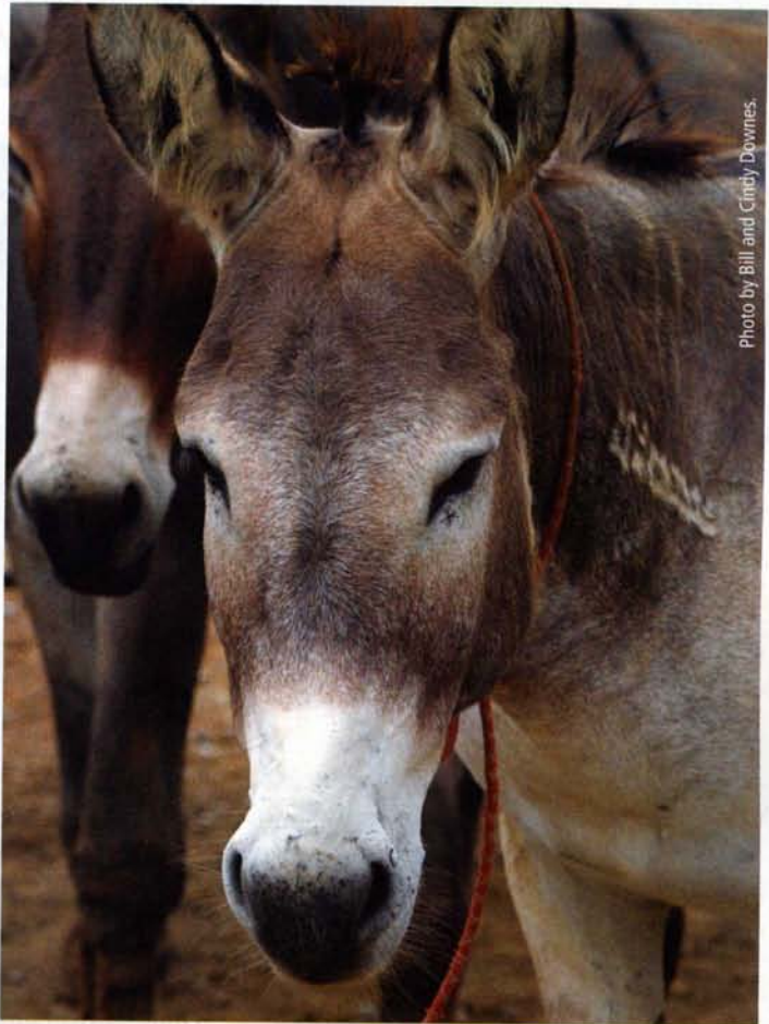
Burros waiting to be adopted at the Wild Horse and Burro Adoption Center in Pauls Valley, Oklahoma.

For example, a field trip to the Oklahoma City National Memorial in Oklahoma City, Oklahoma, will naturally focus on the 1995 bombing of the Alfred P. Murrah Federal Building. The focus for a trip to Philadelphia, Pennsylvania, however, might be narrowed to a particular event such as the Underground Railroad, a particular person such as Benjamin Franklin, or even a particular animal in the Philadelphia Zoo.